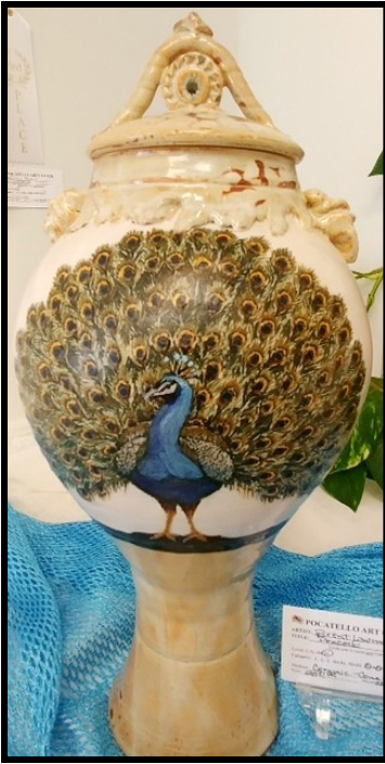
Brent Lowman's first place Ceramic piece entitled, "Peacock" with its harmonious, glowing colors inspires the viewer to imagine the swirling movement of the peacock as it fans its tail.